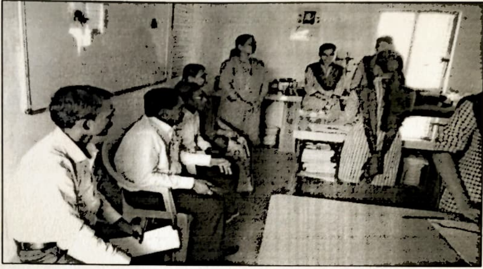
Students demonstrating Rakhi with all associates