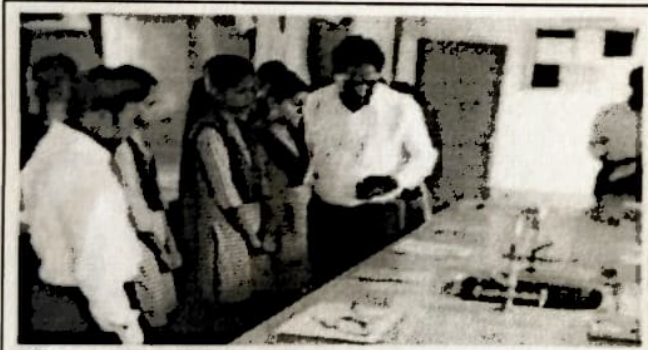
रिसोड : राखी प्रदर्शनीची पाहणी करताना मान्यवर.