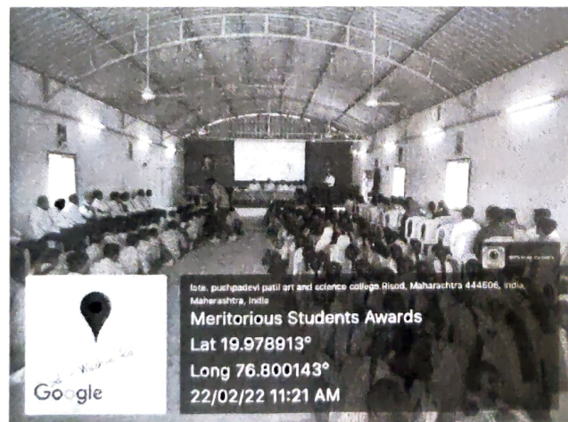
Honourable Dias, Teaching & non-Teaching and Student Present on the Occasion